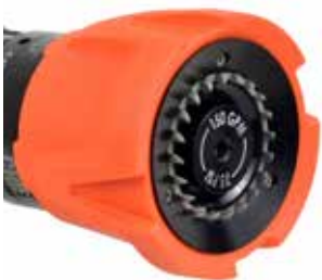
Spinning Stainless Steel (Standard)

Choose from spinning stainless steel metal or fixed molded urethane teeth.