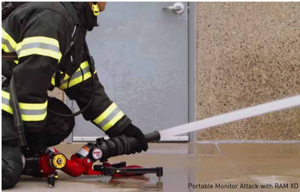
Portable Monitor Attack with RAM XD