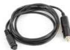
Optional Car Charger