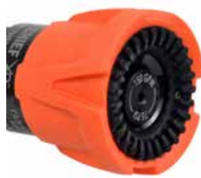
Fixed Molded Urethane