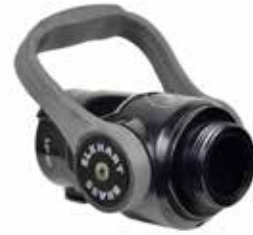
1.5" XD Shutoff