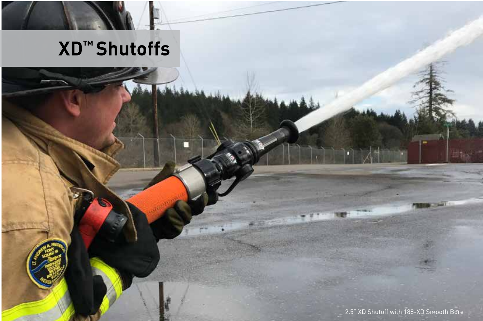
2.5" XD Shutoff with 188-XD Smooth Bore

Elkhart Brass XD Shutoffs and Playpipes are designed and constructed for rugged use and reliable performance. They are built strong with forged shutoff bodies and forged metal bale handles earning the title Xtreme Duty, or XD. They provide an excellent foundation for break-apart applications using smooth bore or fog nozzle tips. Elkhart Brass XD Shutoffs are available with a variety of options, including built-in smooth bore discharges that can be used with fog nozzle tips for maximum versatility.