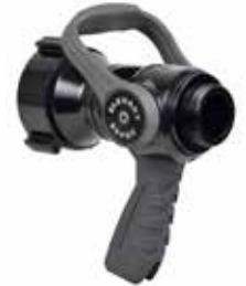
2.5" XD Shutoff w/ Pistol Grip