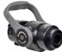
1.5" XD Shutoff w/ Smooth Bore