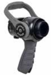
1.5" XD Shutoff w/ Pistol Grip