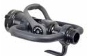
2.5" XD Playpipe w/ Ladder Hook