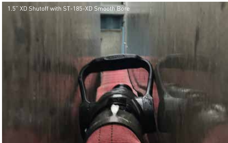
1.5" XD Shutoff with ST-185-XD Smooth Bore