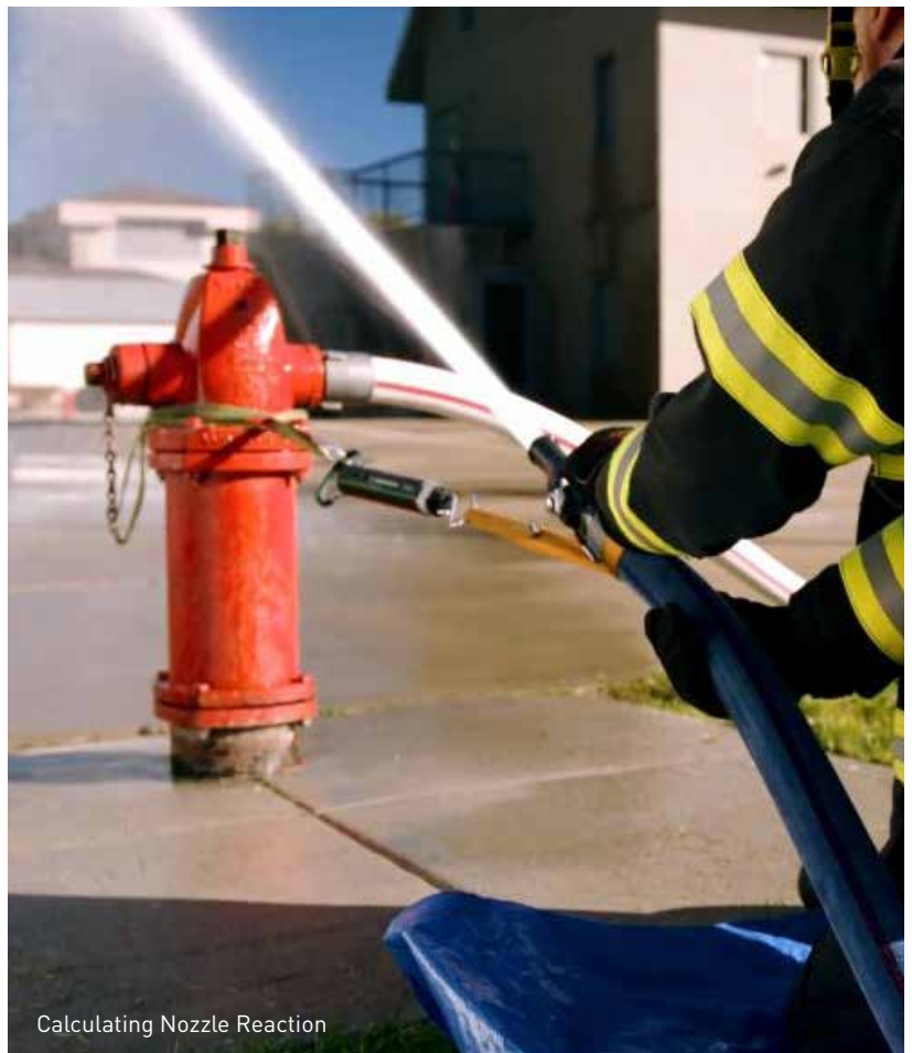
Calculating Nozzle Reaction