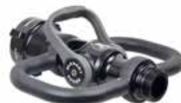
2.5" XD Playpipe