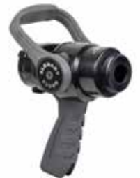
1.5" XD Shutoff w/ Smooth Bore & Pistol Grip