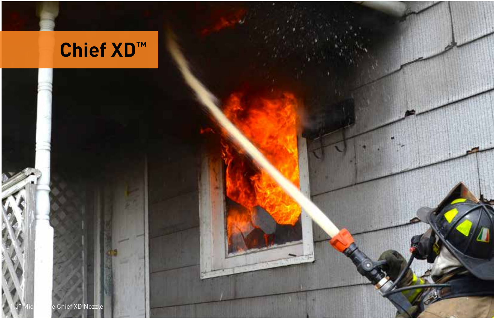
5" Mid-Range Chief XD Nozzle

The Chief XD takes the industry standard for handline nozzles to a whole new level. It offers accurate high volume flows at low tip pressures and is built tough like no other nozzle for Xtreme Duty, or XD. The Chief XD is the only handline nozzle that offers a forged shutoff body and forged metal bale handle for maximum strength. It also includes as standard a full round metal ball for the best stream performance, as well as fixed molded urethane or spinning stainless steel metal teeth that don't break. All indicators and markings are laser etched, with no labels to peel off or scratch. Ergonomic grip inserts help with handling and can also be color coded. It's durability and efficiency ensures an embedded level of safety for you and your crew, fire after fire.