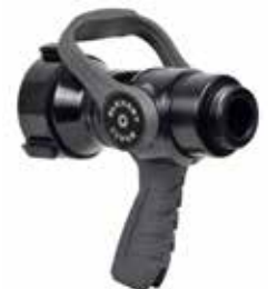
2.5" XD Shutoff w/ Smooth Bore & Pistol Grip