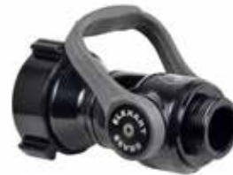
2.5" XD Shutoff