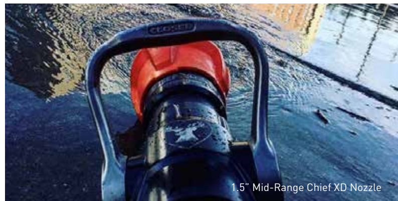
1.5" Mid-Range Chief XD Nozzle