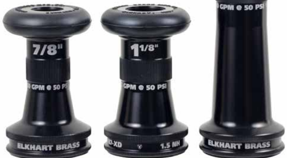
“Short Barrel” 187-XD