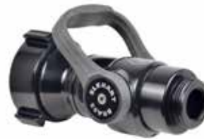
2.5" XD Shutoff w/ Smooth Bore