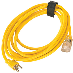
9606 Power Cable